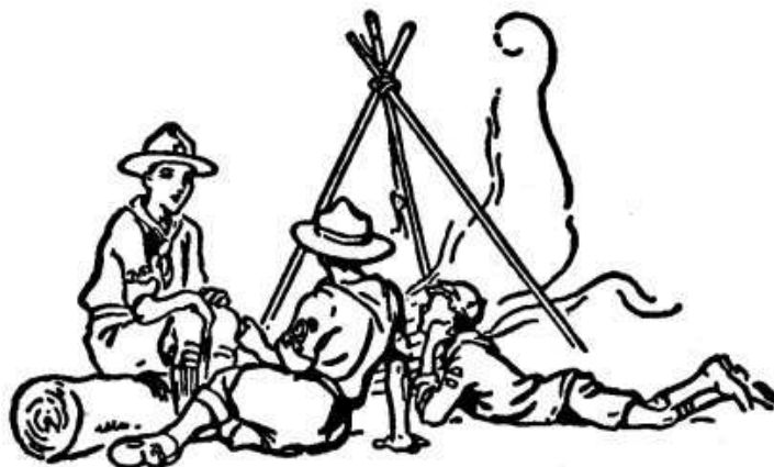
Members of the Scouting family: Cub, Scout and Senior Scout