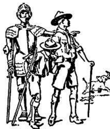
The Scoutmaster guides the boy in the spirit of an older brother.