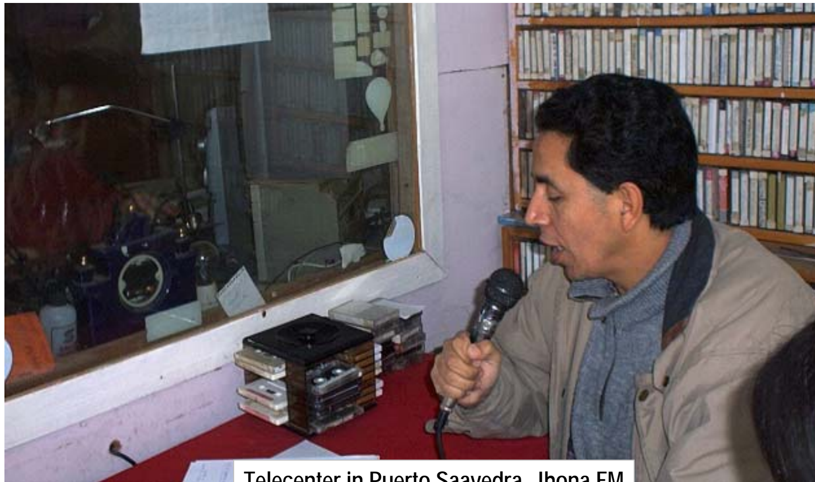
Telecenter in Puerto Saavedra, Jhona FM