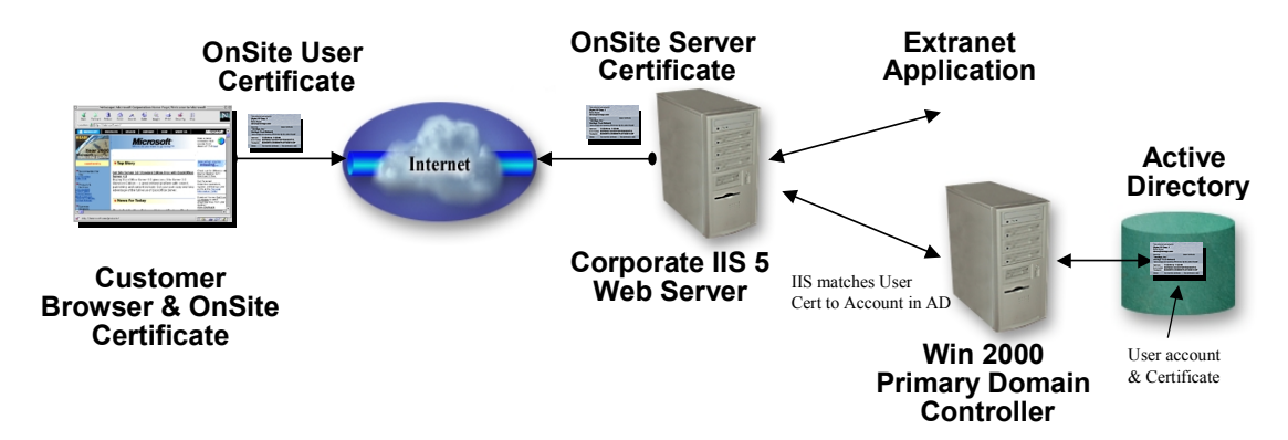
Figure 2: Mutual SSL Authentication

For example, you can create customers' accounts in the Active Directory and then issue SSL certificates for client authentication to customers' browsers. When users log onto your site with their certificates, IIS verifies their account privileges against the Active Directory and then logs them in. The benefit of this solution is that no additional database is required for authentication or management of external users. An additional benefit of issuing server certificates through OnSite is that the certificates are automatically trusted by virtually all browsers, eliminating the cumbersome process of distributing root keys to all your partners.