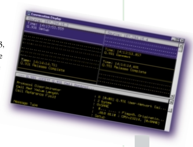
FIREBERD DNA-323's Conversation Display view provides thorough Q.931 data in plain English.

Due to the complicated call set-up and tear-down nature of H.323, call signaling analysis is vital to verify call connectivity. Because the call signal information carried in the Q-931 Call Control Message is typically segmented over a number of packets, technicians need an analyzer that re-assembles protocol data units. FIREBERD DNA-323 exceeds the capabilities of traditional protocol analyzers by performing this key task in addition to providing complete decode of the H.245 protocol stack and displaying session-end handshaking in an easy-to-interpret format.