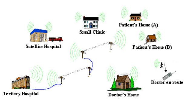
Fig. 1 Wireless IP telephony WAN for telemedicine

The most important advantage of wireless IP telephony system for telemedicine is the integrated transmission of voice traffic, patients' images and demographic data. An independent wireless IP wide area network (WAN) has been proposed and tested for telemedicine applications. Figure 1 illustrates an outline of the wireless IP telephony system for telemedicine.