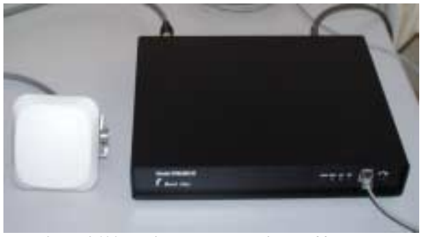
Fig.2 RTB2400 wireless router manufactured by Root Inc.

The wireless IP telephony system described in this paper is based on the integration of two advanced products: the RTB2400 wireless router and the IP Phone 323 software. The RTB2400 is manufactured by Root, Inc., a Tokyo-based R&D firm founded in 1993 ( Fig. 2 ). IP Phone 323 is a software product of OSI Plus Corporation, a KDD subsidiary. The RTB2400 and IP Phone 323 have already been used in many applications independently. IP Phone 323 has been put into operation by several IP telephony carriers in the world, including KDD. The RTB2400 has been used to establish several wireless networks in Japan, including a wireless Intranet connecting medical facilities at the Itabashi Health Care Center in Tokyo.