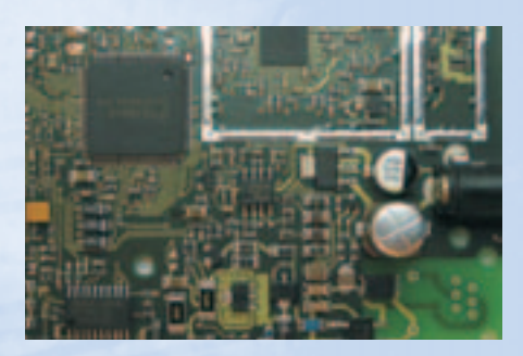
An example of a final PCB for 2.4 GHz, where the RF form factor can be as small as 400 mm<sup>2</sup>

One of the advantages of RTX Telecom's 2.4GHz technology is its high immunity to interference from sources such as microwave ovens.