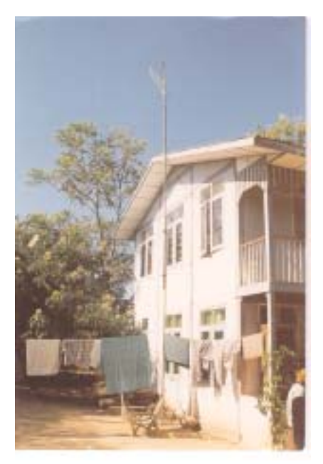
interWAVE's Deployment of a Yagi Antenna

High gain antennas are commonly used in conjunction with fixed cellular terminals in order to increase the range of the cell coverage, or overcome the loss associated with the in-building penetration. This is achieved by installing a costeffective Yagi antenna outside the building, as shown on the picture, or by mounting an antenna on a window.