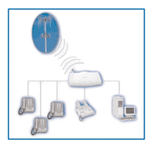
Fixed Cellular Terminal Connections

A fixed cellular terminal can accommodate a fixed line telephone(s), a fax and can also provide a data connection to a computer, as depicted in the diagram below.