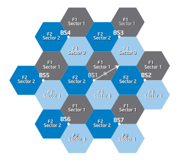
Figure 1. Arrangement of WiMAX cells in 1x3x3 frequency sharing configuration

In the second scenario, an ES is installed in the middle of a number of WiMAX base stations, which will typically be deployed in a hexagonal mesh configuration across metropolitan areas (see figure 1). In this scenario, which would be relevant when WiMAX becomes more widely deployed, interference for the ES can result from a number of BS installations at the same time.