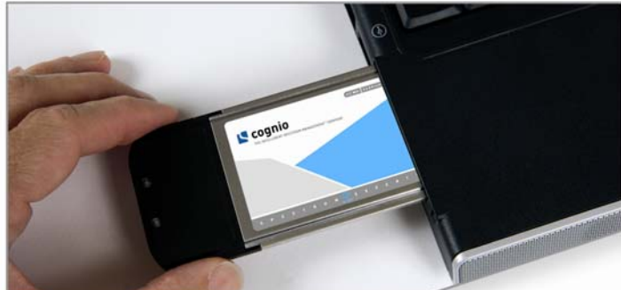
Figure 1 - Cognio's Spectrum Expert PC Card. An external antenna is also available.

energy-based spectrum analysis. As was mentioned earlier, spectrum analysis can be accomplished with traditional spectrum analyzers, but we recommend newer (and more WLAN end-user focused) PC-based tools from the above companies and Cognio. Cognio's Spectrum Expert [ http://www.cognio.com/solutions_mobile.html ], a combined hardware/software tool (see Figure 1), runs on notebook computers equipped with a PC Card slot, is very easy to use, even by non-engineers (radio and otherwise), and displays a great deal of information useful in identifying, evaluating, and remedying interference. The use of these tools provides initial information as to the nature of RF traffic, regardless of device or protocol, allowing a baseline to be established and from that the identification and ideally correction of any obvious interference or traffic-related problems.